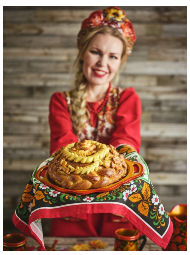
Offering bread and salt

2 with an English translation on the back cover.)