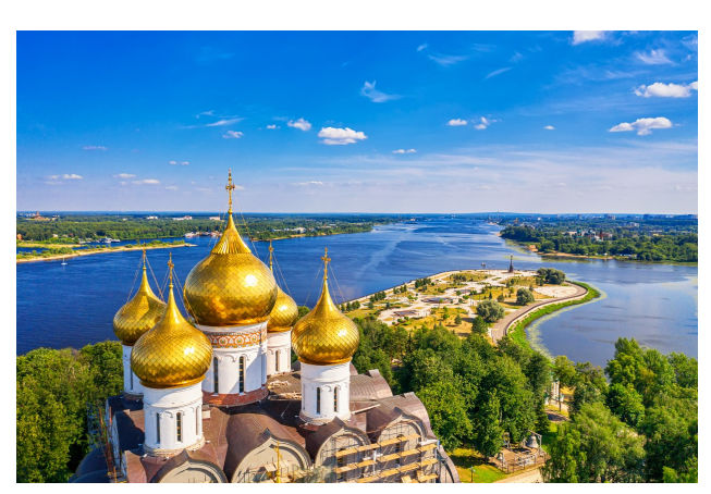
Yaroslavl on the "Golden Ring"

On days when our ship was under sail, we had lectures in the top deck theater, usually on environmental issues of both the United States and Russia. Russian topics included the ecology of the Volga River and the Leningrad basin and a wrenching presentation by a young couple who had been