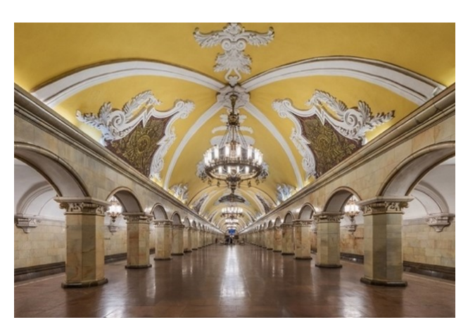
Moscow metro station

minimal cabins and bathrooms so tiny the handheld sink faucet doubled as a shower!) The peasant-style food was plentiful—lots of beet and vegetable soup, fish and meat, sour cream, coffee, and tea—and well-served by a staff of waitresses. There were large urns of boiling water in the hallways and metal water pitchers in our cabins, so no "Trotsky's Revenge" was likely. I was quite happy with the accommodations, though I must say I could have done without the Russian pop music piped through my cabin intercom during all waking hours. I turned the volume down as far as possible (but why couldn't it have been Tchaikovsky?)