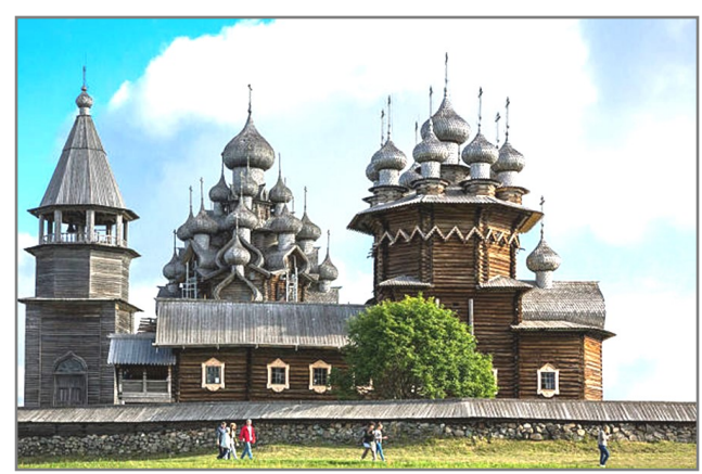
Kishi, an open-air museum and World Heritage Site

At the end of our monastery visit, we were faced with the long walk back to the ship, but here fate stepped in with one of the most memorable incidents of the trip. A small fishing vessel tied up near the monastery was about to pull out, and the fishermen asked a couple of us ladies if we'd like a ride. The men were steaming fish on the deck, and we skimmed across the blue Ladoga waves eating