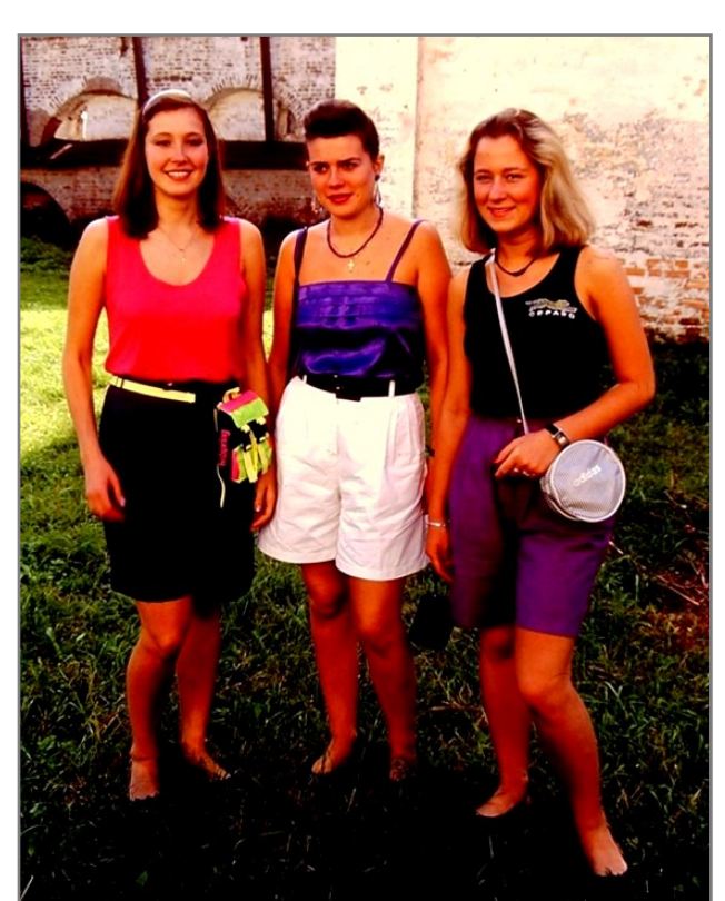
Our young Russian translators

It was a beautiful sunny Friday, August 16, and a windsurfing couple in bikinis were my first memorable view of Moscow from my large cabin window. A tour of the ship's four passenger decks oriented us to the dining room, music room, sun deck, and "theater" (where we were to have our ecology discussions). I had my own cabin (for which I had paid an additional $300), and the ship was beautiful and well-managed though spartan. (Think