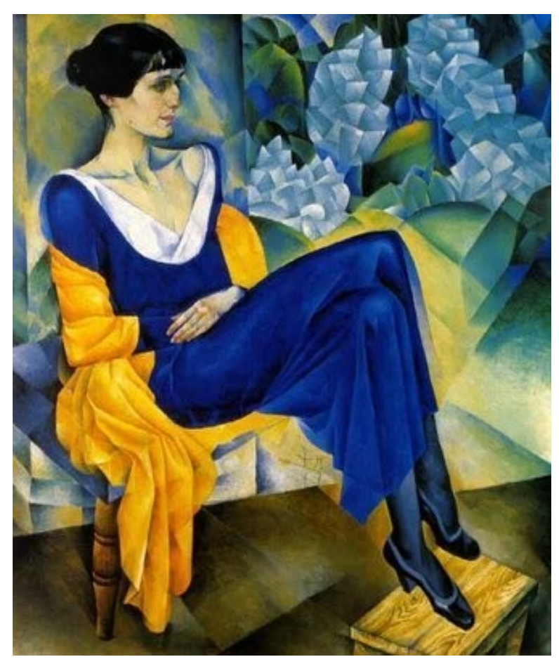
Anna Akhmatova by Natan Altman (1914)

emerged from this small group, acutely conscious of its isolation from the mass of the people. For them, socialism was both a substitute for the religious faith many of the young intellectuals had lost and a recipe for overcoming the great cleavage in Russian society between the privileged elite and the oppressed masses. All the varieties of Western socialist thought filtered into Russia from the 1830's on, but they underwent a transformation shortly after their arrival. They took on a pronounced messianic streak that ultimately derived, some scholars have suggested, from the old national myth of "Holy Russia" as the bearer of true Christianity (even if