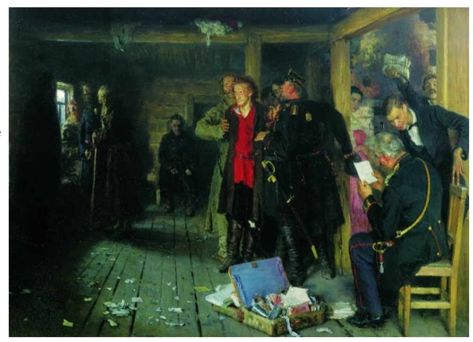
Arrest of a Propagandist (1892) by Ilya Repin

Meanwhile, Russia's material backwardness, caused by its lack of port cities and its distance from Western trade routes, produced a series of interrelated consequences. First, a chronically ambivalent attitude toward the West, whose economic and technological prowess was admired and envied, was also feared as a threat to Russian power and culture. Second, the pattern of development became one of "revolution from